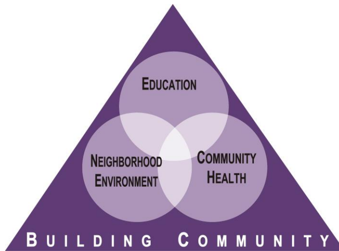
Figure 1 Service learning project areas